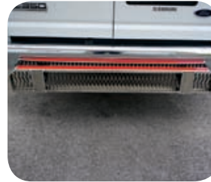
Flip-Up Aluminum Grip Strut Rear Step