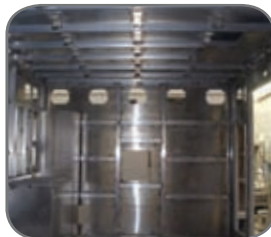
Extruded Tube Framing