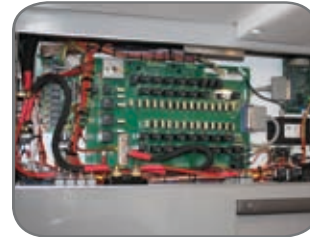
Printed Circuit Board with LED Diagnostic Lights